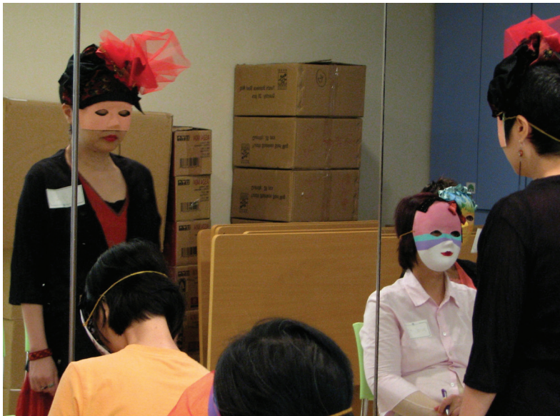
Figure 16.9: The voice from my half-mask