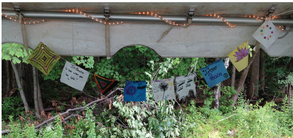
Figure 18.5: Prayer flags: "What I Want to Carry With Me"