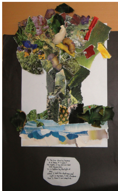
Figure 10.3: Personal tree