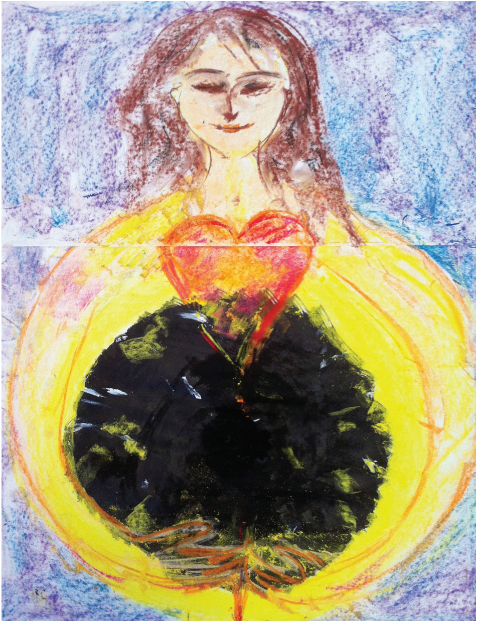
Figure 14.6: What does it need?