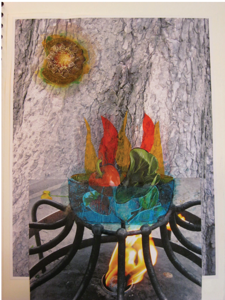
Figure 4.8: Eternal Nourishment