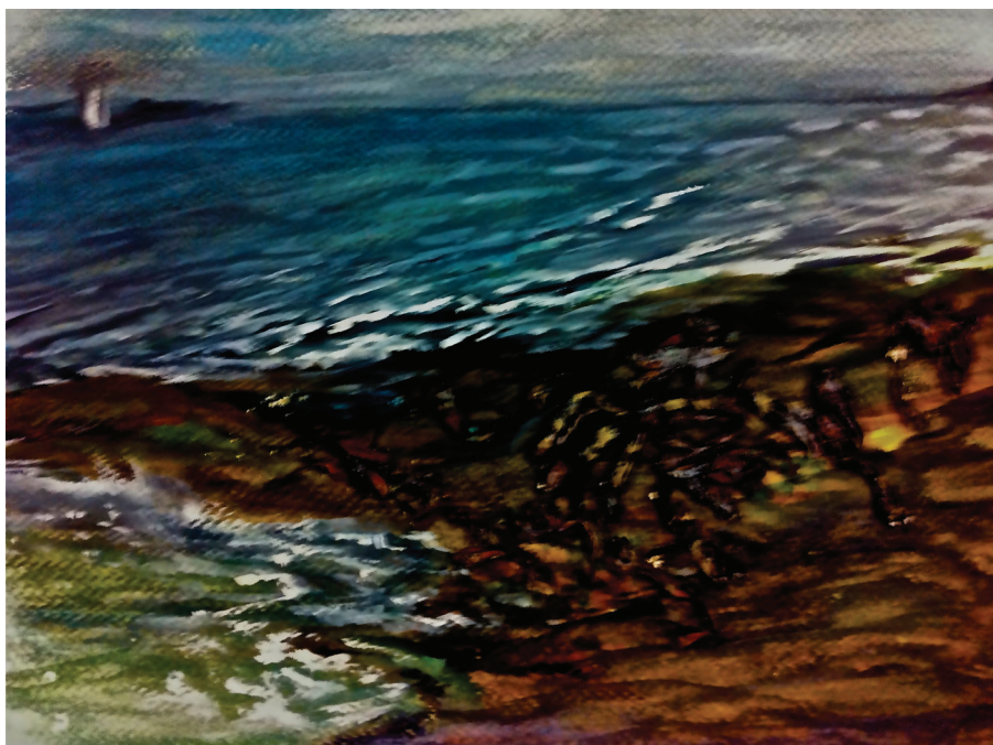
Figure 11.1: Visualization of mother's cancer washed away