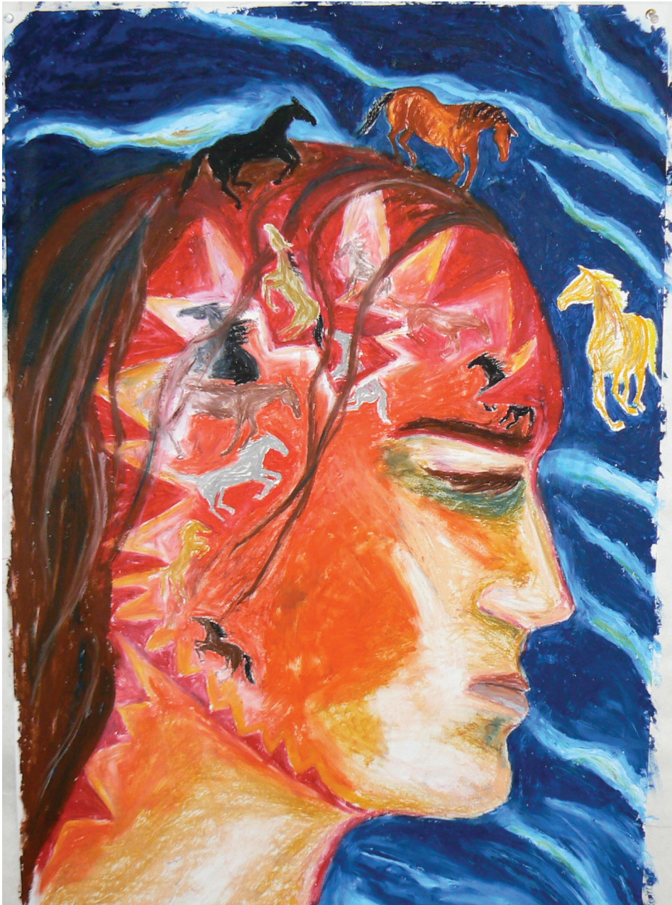
Figure 19.1: Student art of agitated thoughts